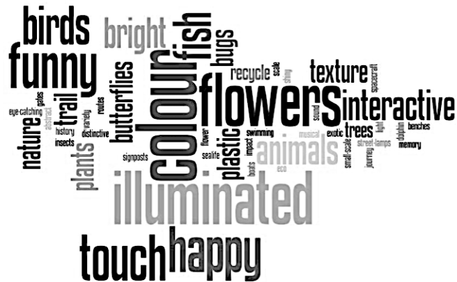
Wordall diagram of themes from the SPUD project

We feel our proposal brings together and provides design opportunities satisfying many of the Wordall themes of nature, wildlife, history, colour, play (funny), recycle, sign-posts, eye-catching, journey and trail etc.